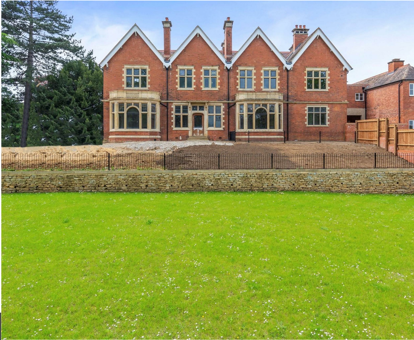
First Floor Apartment